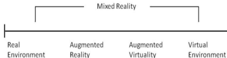
Figure (1) Milgram's Reality-Virtuality Continuum

According to the Milgram's reality-virtuality continuum (Figure 1), AR lies among the virtual environment and the real environment (Milgram et al., 1994).