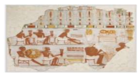
Plate 1 Carnelian bead - manufacturing , Dynasty 18, from tomb of Sobekhotep at Thebes (Harrell , 2012)