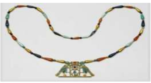
Plate 2 Necklace with beads of Lapis Lazuli, Carnelian, Turquoise and others, Dynasty 12, from tomb of princess Sithathoryunet at EL Lahun (MMA 16.1.3)(https://metmuseum.org/art/collection/search/544232)